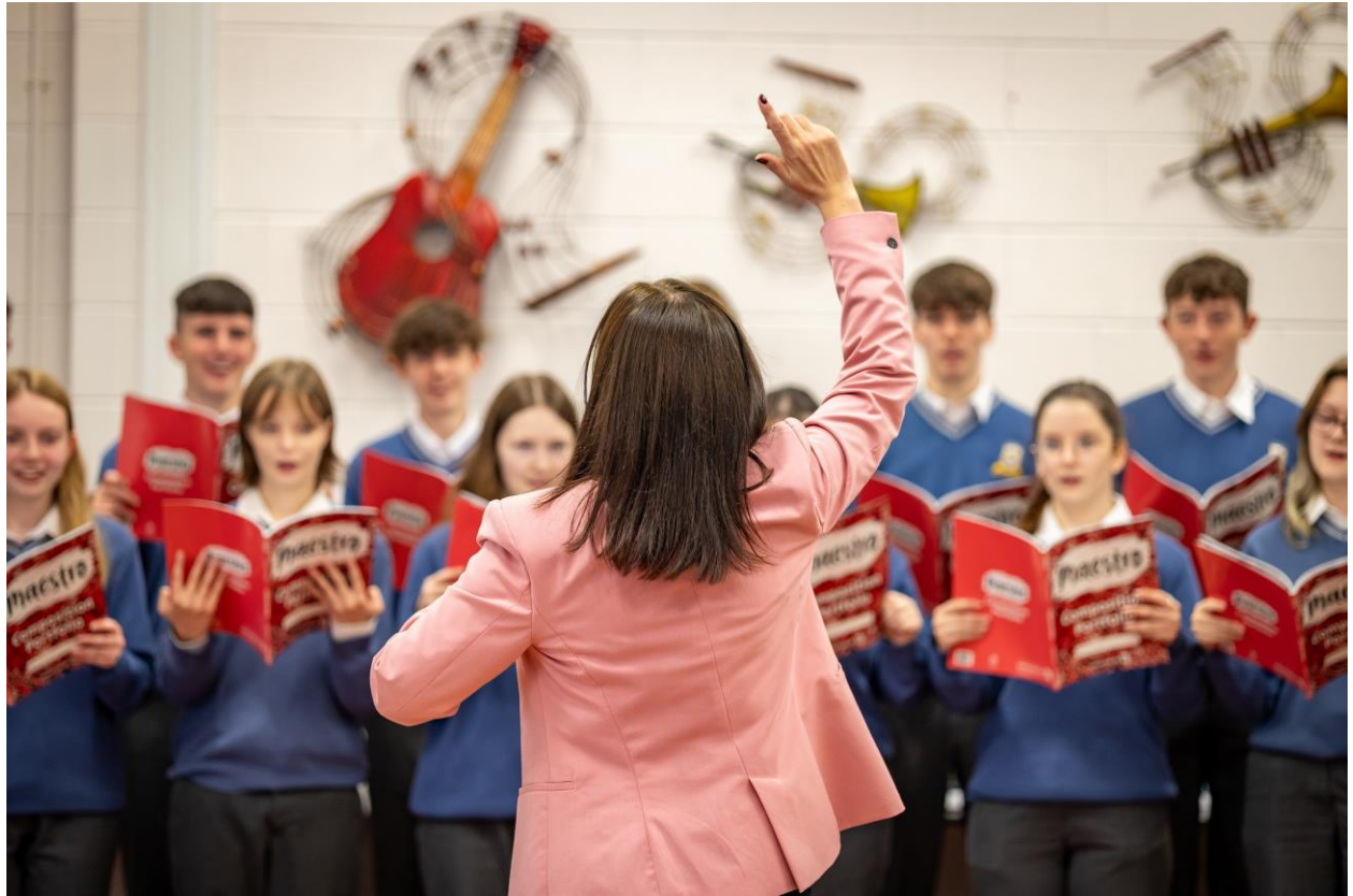
1st Year Welcome Evening 2024